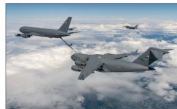
KC-46 Aircraft Refueling a Receiver Aircraft

Source: © 2018 Boeing Company - Photo by Paul Weatherman | GAO-18-353