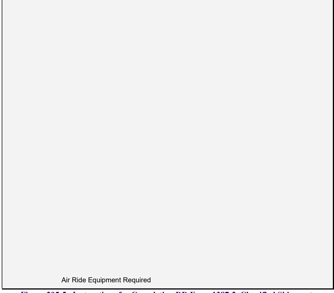
Figure 205-5. Instructions for Completing DD Form 1387-2, Classified Shipments