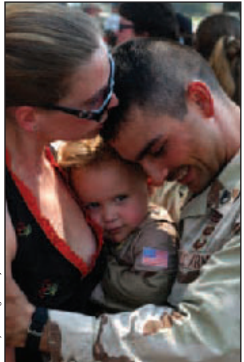
Army Staff Sergeant hugs his wife and daughter after arriving home with fellow members of the Louisiana Army National Guard's 256th Brigade Combat Team.