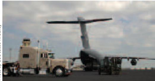
Hurricane Wilma relief aid is unloaded from a C-17 Globemaster at Homestead Air Reserve Station, FL.

As the fiscal year opened, while continuing to support Operations ENDURING FREEDOM and IRAQI FREEDOM in the Global War on Terrorism, USTRANSCOM: