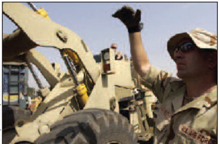
US Airman loads trucks with humanitarian supplies for ground transportation at Chaklala Air Base, Pakistan, in support of earthquake relief efforts.