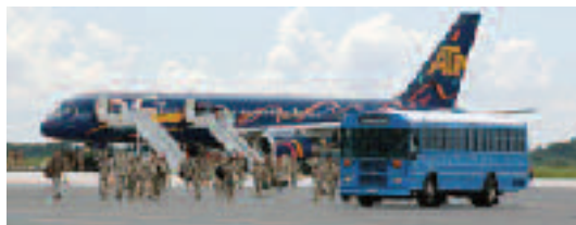
Soldiers and Airmen from USCENTCOM walk across the flight line after exiting an Air Transportation Association commercial liner as they return home following deployment in support of Operation IRAQI FREEDOM.