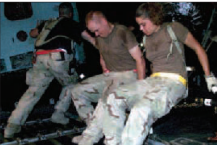
Airmen offload palletized aircraft parts and maintenance equipment from a USAF C-5A Galaxy aircraft at Moron Air Base, Spain, while deployed in support of Operation ENDURING FREEDOM.