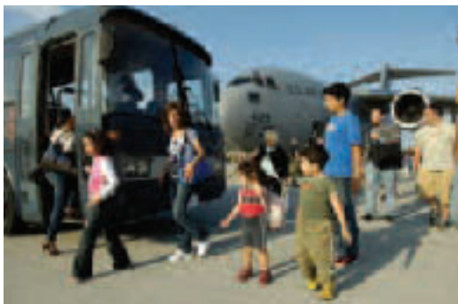
In support of the Department of State, AMC evacuates US citizens from Lebanon in July 2006.