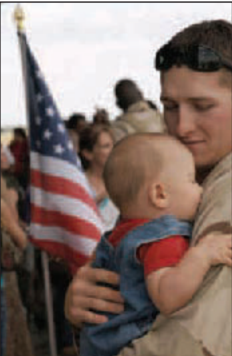
A US Navy Seabee holds his son after returning from deployment.

As it was so often before throughout our history, what we face today isn't a clash between civilizations; it's a clash about civilization. What we do — especially what we do together — is not only important, it is vital. USTRANSCOM's support for and, though often quiet and unseen, service on behalf of all engaged in this great, long struggle is making a difference in this world.