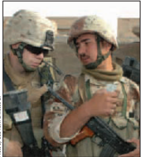
US Marine and Iraqi army soldier discuss information about a suspect during a joint patrol in Khandari, Iraq.