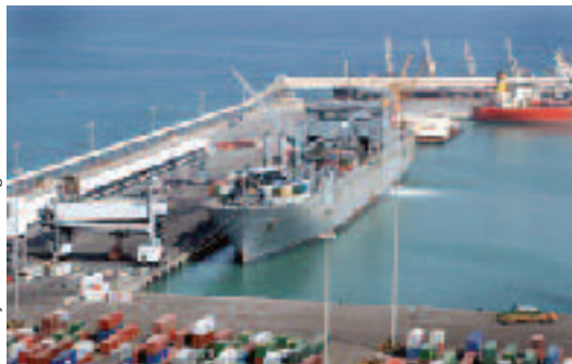
Bob Hope class large, medium-speed, roll-on/roll-off ship is tied up at the pier at the port of Mina Ash-Shuaibah, Kuwait to take part in troop rotations from Iraq during Operation IRAQI FREEDOM.

During combat operations, USTRANSCOM moves more than 90 percent of the equipment and supplies needed to sustain US military forces by sea. MSC provides ocean transportation via organic and chartered commercial ships to deliver combat equipment, vehicles, fuel, supplies, and ammunition to sustain US forces worldwide. MSC provides both common-user strategic sealift capability and theater-specific prepositioned support through its four distinct business areas (Tanker Operations, Dry Cargo, Strategic Surge, and Afloat Prepositioned Force-T).