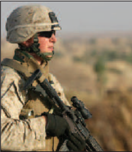
US Marine Corps Lance Corporal conducts a patrol in Al Ish, Iraq.