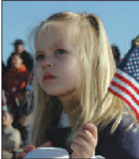
A child waits for her family member to return from deployment.