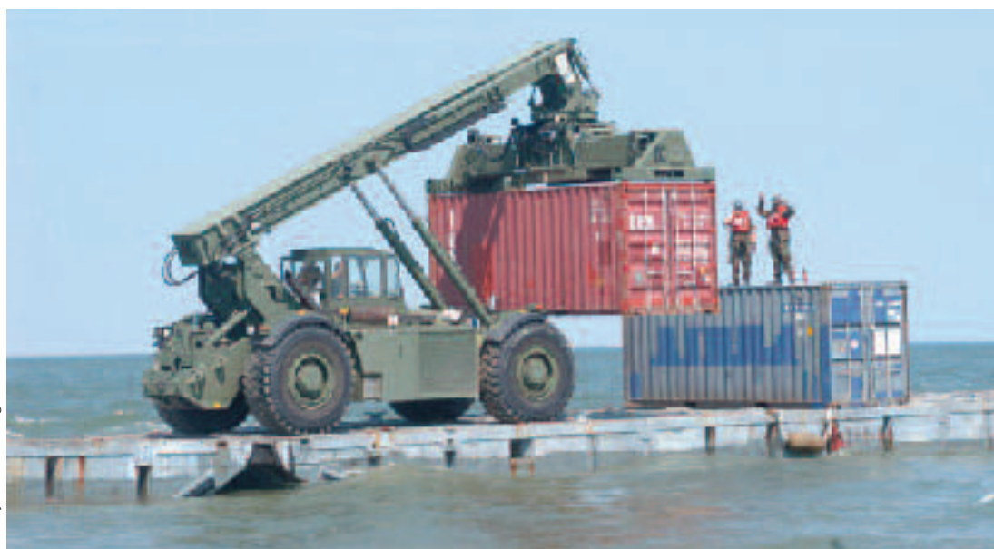
Naval Amphibious Construction Battalion Two discharging containers across the beach from a causeway ferry during Joint Logistics Over-The-Shore (JLOTS) 2006, a multi-service cargo distribution exercise. JLOTS operations discharge strategic vessels without the benefit of a fixed port. SDDC provided the JLOTS 2006 joint task force commander.